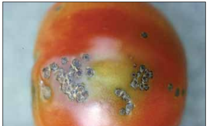
Figure 5. Bacterial spot causes lesions up to \frac{1}{4} inch that are often rough or cracked in appearance.