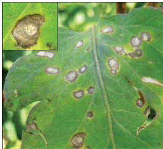
Figure 1. Septoria leaf spot lesions often have small black specks (fungal spore-producing structures).

Sanitation measures in the fall reduce the amount of inoculum available for infection the following year. In the fall, deep plow tomato plots to bury tomato debris, or remove and destroy dead plants. Avoid planting tomatoes in the same area of the garden year after