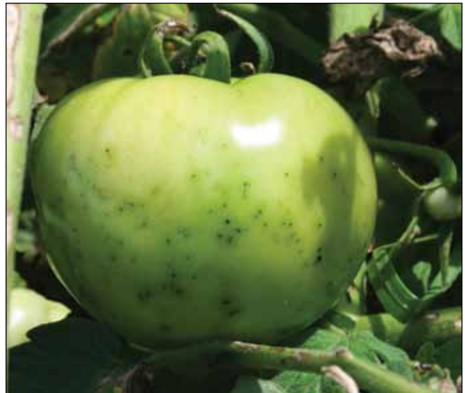
Figure 4. Bacterial speck causes tiny black lesions on fruit.

Bacterial canker, a third bacterial disease, can be a serious problem in commercial and small garden tomato plantings. This disease can cause lesions or cankers on any portion of the plant, including the fruit, or it can result in a general wilt or decline of the plant. Diseased tomatoes first exhibit yellowing and wilting of leaves on a portion of