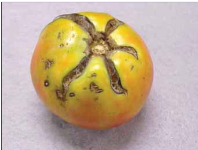
Figure 11. Radial growth cracks.

Select cultivars less prone to cracking. Provide even water and balanced nutrition to avoid overly lush growth. Limit fruit exposure to sun through proper staking or trellising, and by managing foliar diseases.