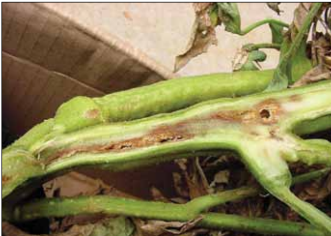
Figure 6. Bacterial canker can cause a rotting in the stem, visible as discoloration when the stem is cut.

The bacterium can be introduced into fields on contaminated seed or on infected transplants. The bacterium also can survive in soil on infested plant material for at least 1 year. During the growing season, the small bacteria are dispersed by water (irrigation or rain) and infect plants through wounds or natural openings. Once inside the plant, the organism can invade the water-conducting tissue and be carried systemically throughout the plant.