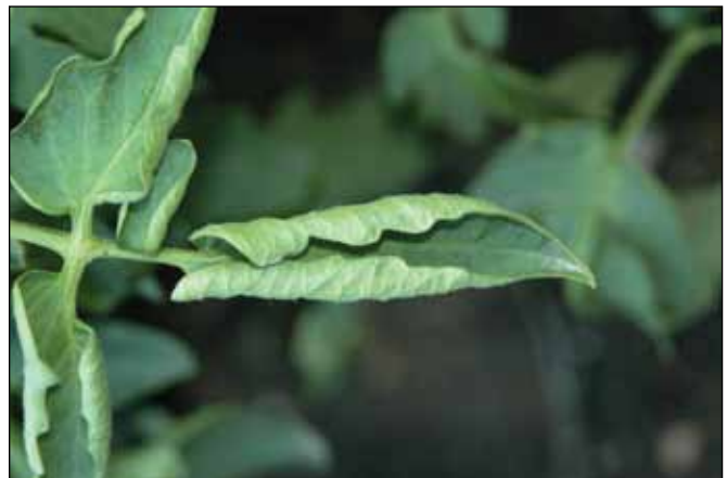
Figure 9. Physiological leaf roll.