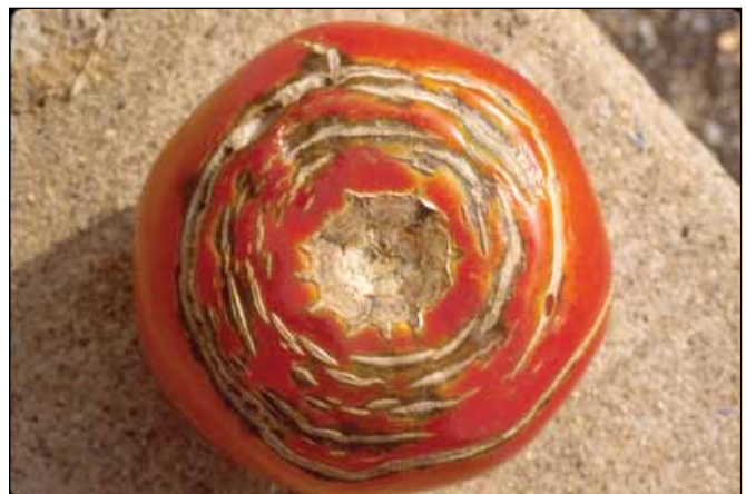
Figure 10. Concentric growth cracks.