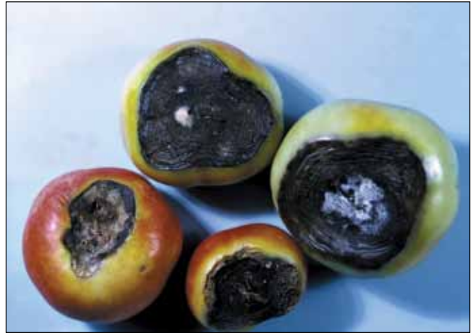
Figure 8. Blossom end rot causes sunken, water soaked lesions that eventually turn black.

Growth cracking occurs on tomato fruit that expand too quickly. It is most common on nearly ripe fruit, but it can occur on younger fruit. Cracks develop in concentric circles around the stem scar (Figure 10). They also can