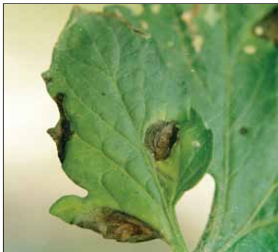
Figure 2. Early blight lesions on tomato leaves usually have a target-like appearance.