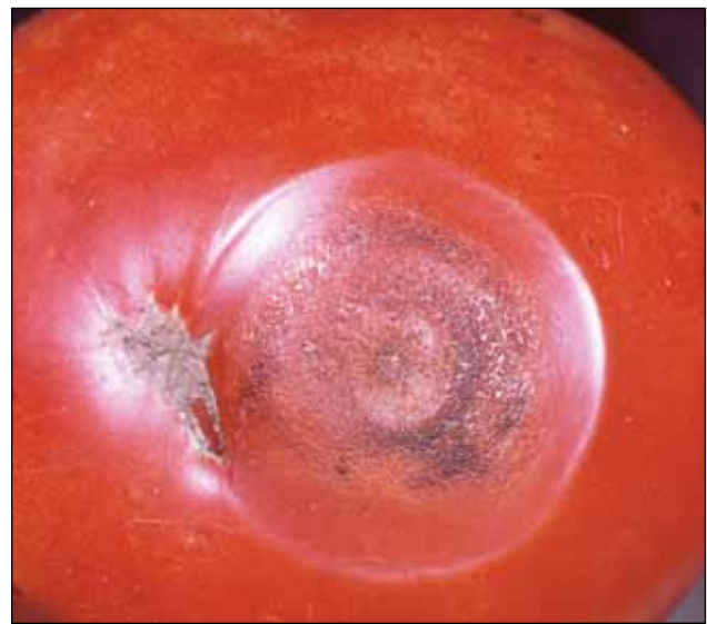
Figure 3. Anthracnose causes circular, sunken areas on ripening fruit which later support numerous fungal spore-producing structures (black specks).

Homeowners can refer to Table 1. Commercial growers should consult the Midwest Vegetable Production Guide for Commercial Growers ; a management guide published every year. Contact your local K-State Research and Extension Office or the K-State Plant Diagnostic Lab for ordering information.